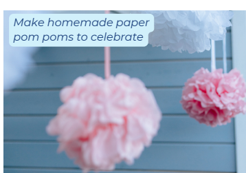
Make homemade paper pom poms to celebrate