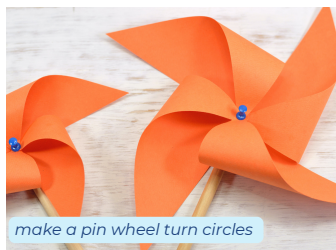
make a pin wheel turn circles