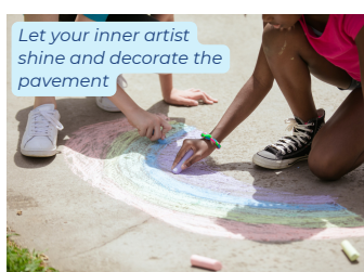
Let your inner artist shine and decorate the pavement