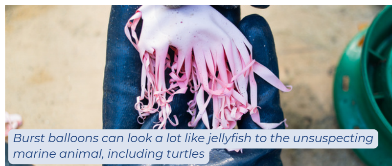
Burst balloons can look a lot like jellyfish to the unsuspecting marine animal, including turtles

Balloons, even latex ones, are not 'biodegradable', meaning they hang around in the environment as litter for years, all the while posing a threat to wildlife. Many sea turtles mistakenly ingest balloon remnants that look like jellyfish.