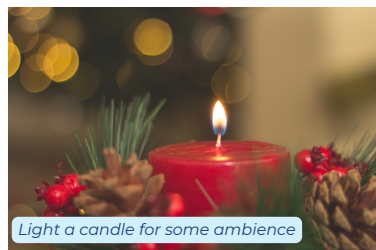
Light a candle for some ambience