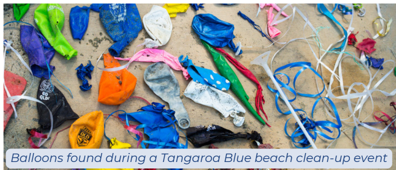
Balloons found during a Tangaroa Blue beach clean-up event

Celebrations make life special and we can commemorate these occasions with eco party alternatives that are fun, lasting, and memorable, which show just how much we care for each other, as well as our natural world.