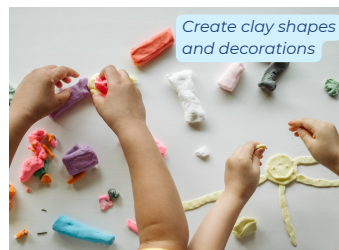
Create clay shapes and decorations